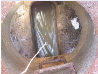
Flow measurements are taken throughout the collection system to determine the correct pipeline size.