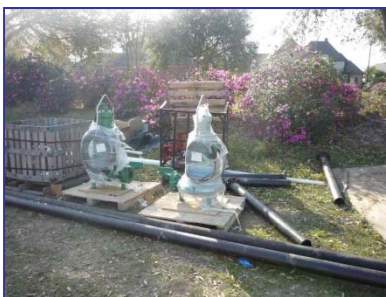
New submersible pumps wrapped from the factory and ready for installation into wet wells.