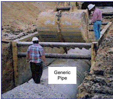
Collection system pipe sizes range from less than a foot to over six feet in diameter.

This project is primarily located north of Zachary with additional pump station upgrades north of the City of Baton Rouge. These upgrades are required to alleviate SSOs at and near the pump stations and their upstream basins.